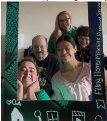
Lillian and North Harmony homes enjoying the props!