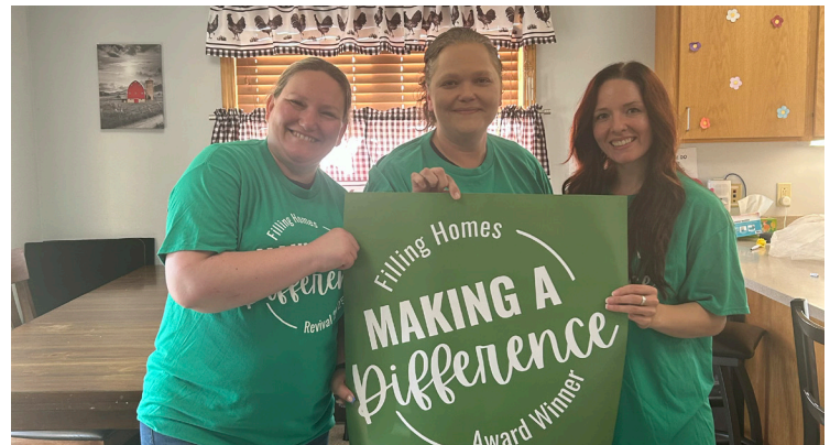
North Harmony staff proudly Making A Difference!