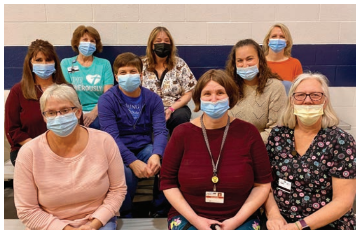
Staff in attendance with 15 years of service or more.