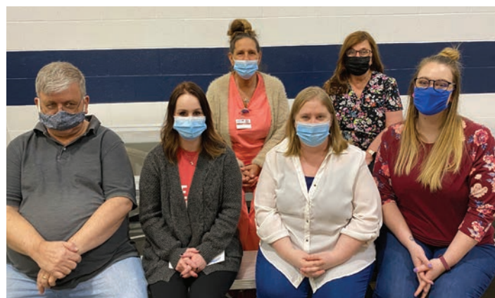
Staff in attendance with 5-10 years of service.