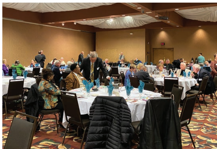
More than 100 guests representing congregations across the tri-state area, LMM board members and agency staff filled the Pinnacle ball room at the in-person event.