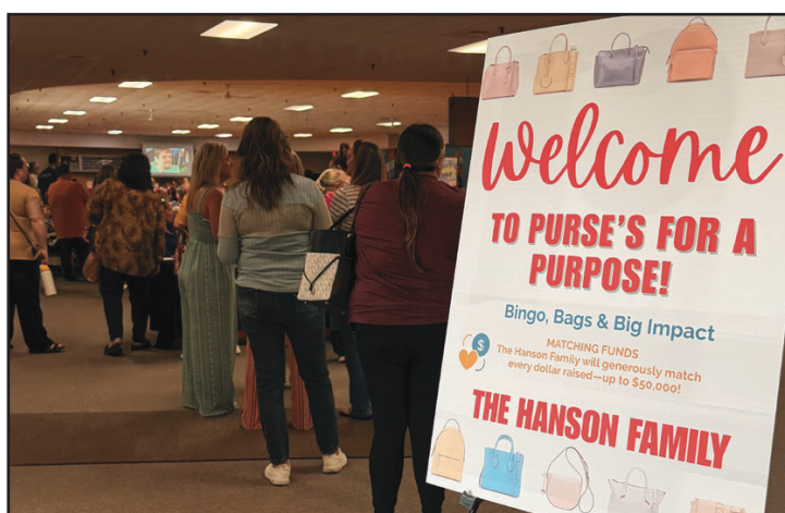
Guests lined up at registration, ready to win big!