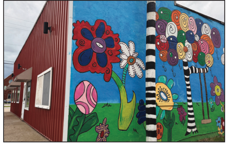
New Soaring Arts Pottery building located in Downtown Napoleon

Soaring Arts began in 2009 as a small artist-in-residence program at our main campus. What started as a simple space for creativity has grown into a vibrant, thriving program with a strong presence in downtown Napoleon. Today, Soaring Arts Studio and Studio Express continue to provide daily opportunities for individuals across Filling Homes and Northwest Ohio to create, connect, and express themselves through art.